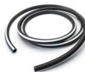
10 or 20 ft. hose