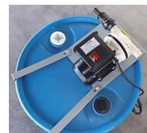
Drum Mounting Kit