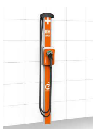
Wall Mount with Cord Management Kit