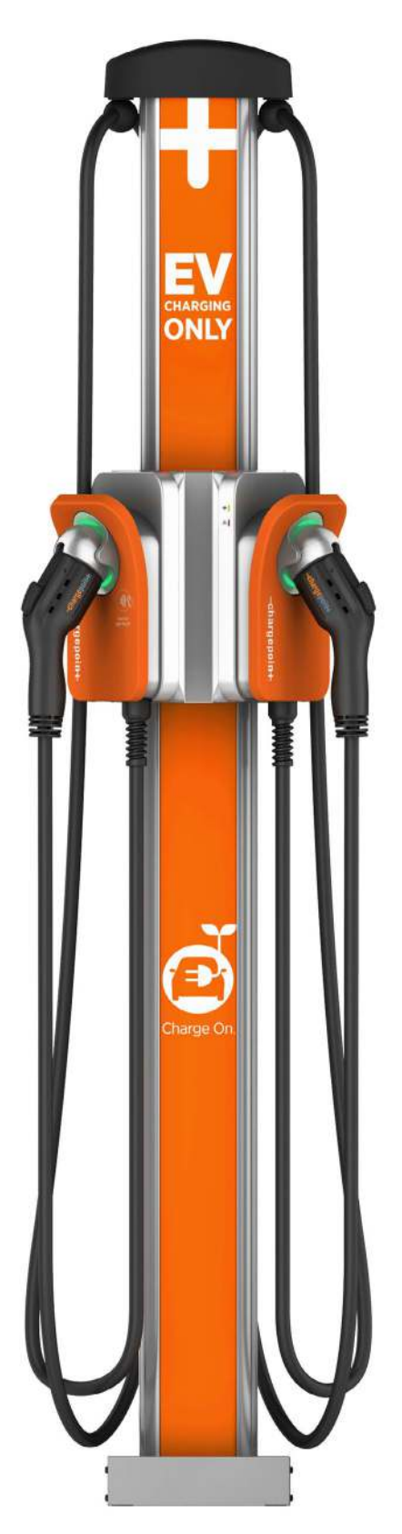
ChargePoint CPF25 Two Stations with Dual Pedestal Mount and Cord Management Kit